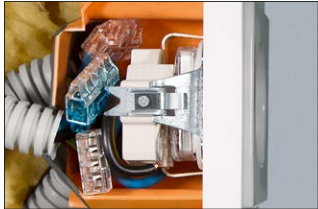
HelaCon Plus Mini fits perfect in every space limited situation.