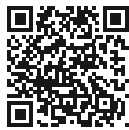
One Step to the Web!