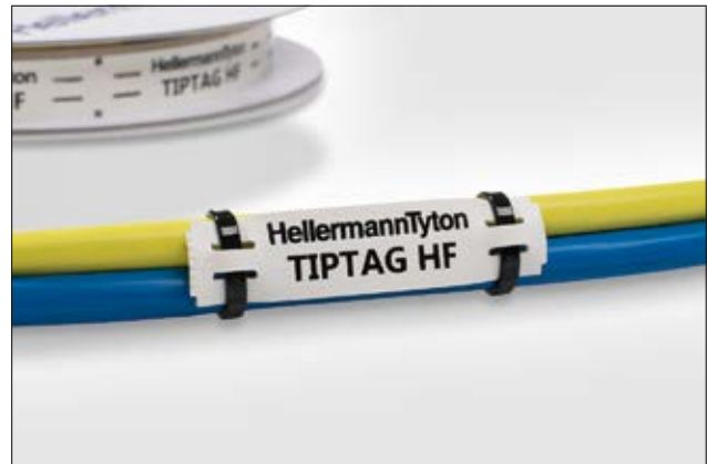
TIPTAG - High performance cable bundle marking.