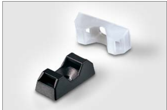
Q-Mount, CTQM 2-way entry, screwable.