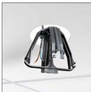
1. Use the delivered tool to install SpotClip in the fixing hole as easy as possible.