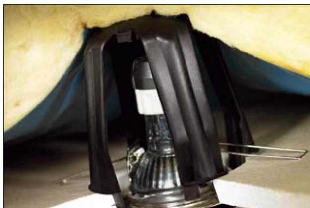
SpotClip-I ensures reliability and safety of lighting installations.

SpotClip-I is a unique solution developed for mounting halogen and LED downlights in plasterboard and ceiling tiles. This innovative 4-leg downlight cover offers outstanding safety and installation features and is suitable for use in both panelling and plasterboard ceilings. SpotClip-I is made from non-flammable, fibre-glass reinforced polyamide, offering a range of thermal and mechanical benefits. It can be installed both during or after construction. The SpotClip-I downlight cover is an optimal solution for a wide variety of applications in existing and new buildings. It can be used in ceiling cavities with diameters of 62 to 90 mm and ensures the safety distance between the downlight, insulation foil and insulation material. SpotClip-I reduces the risk of damage caused to insulation material as a result of overheating and heat accumulation, while potentially increasing the life span of light bulbs.