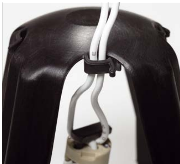
Cable retainers hold the downlight supply cable in place.