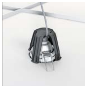
3. Start the installation of the downlight in a safe way.