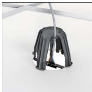
2. Push the spikes into the plasterboard to prevent shifting and disconnect the tool.