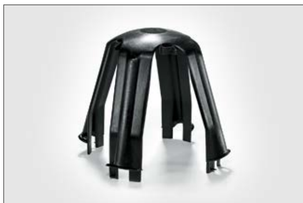
SpotClip-I: 4-leg downlight cover.