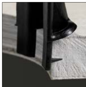
Additional retaining spikes prevent SpotClip shifting and displacement during mounting.