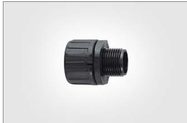
HelaGuard HG-S Straight, IP66.

i Fittings with PG and swivel threads are also available. For our complete range of conduits and fittings, please see our HelaGuard catalogue.