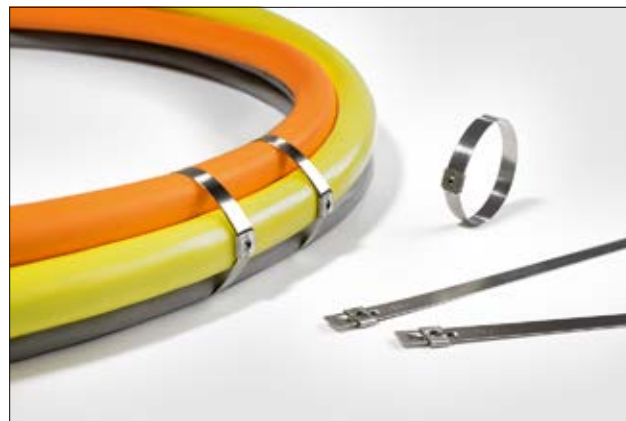
Stainless Steel Cable Ties MST-Series.