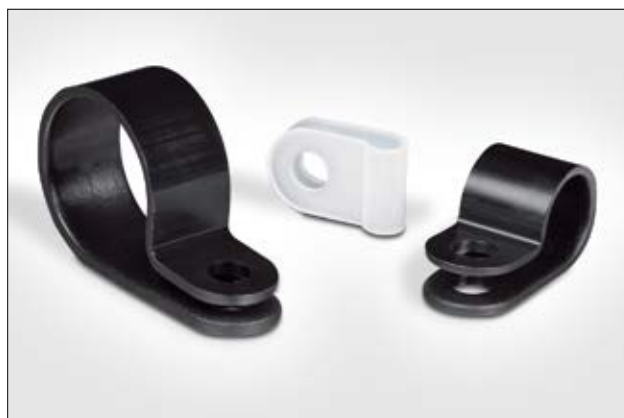
P-Clamps H1P - H18P in different dimensions.