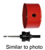
Similar to photo