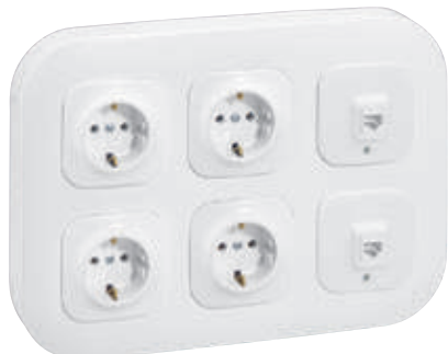
7 824 97 + 2 x RJ 45 sockets Cat.No 7 824 24 (p. 543)