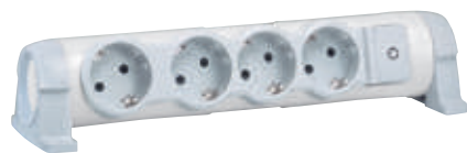
6 946 29