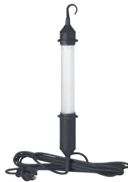
0 622 41

Conform to EN 61 242 A 11 3000 W - 230 V~ (cable entirely unrolled) with thermal switch protection (manually resettable)