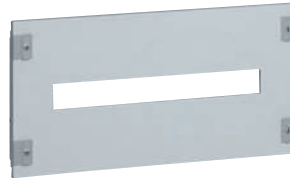
0 208 10