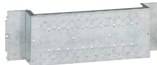
0 206 05