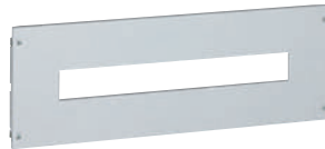
0 209 01