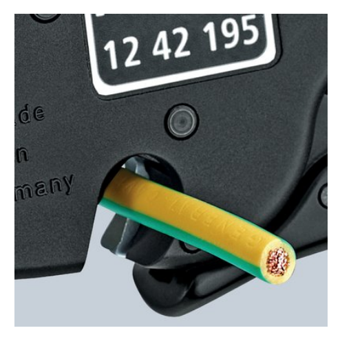
Wire cutter for multiple stranded wire cables up to 10.0 mm²

Steel clamping jaws avoid slipping of the cable