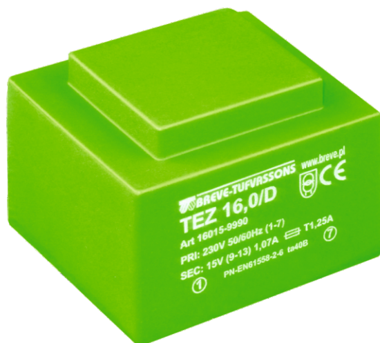
TEZ 0,5 - 16