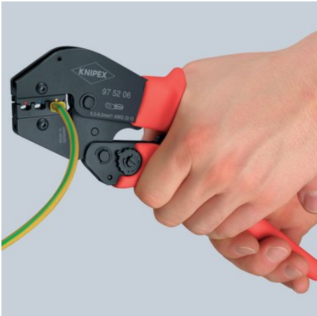
Third step: when greater hand force is required, such as e.g. when crimping insulated connectors 6.0 mm 2 , two-hand operation is possible by the longer handles