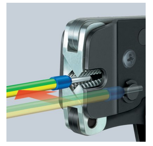
97 53 08: lateral loading of wire ferrules up to 2.5 mm<sup>2</sup> parallely from the side e.g. in confined areas