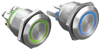
MPI002- front panel seal to IP66