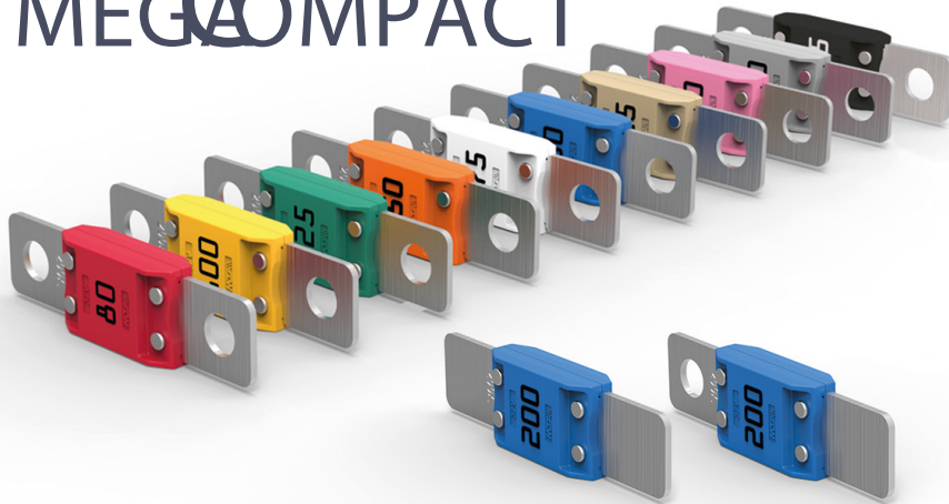
Clinched version available