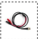
BNC plug to alligator clips cable