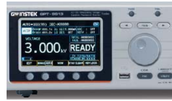
4.3' Color LCD, High-brightness Indicator and Function Keys

Operation design in simplicity is incorporated into the tester through configuring the function keys at the bottom of the LCD screen to easily change the test function by just pressing the function keys, or by rotating the knob to change the measurement value, which greatly improves the convenience of operation; updating various status indicators on the front panel immediately according to the status on the display, which not only provides users with a more comprehensive control of the test status, but also avoids unnecessary operation risks. For example, when the output is executed, the high-voltage output indicator will keep flashing.