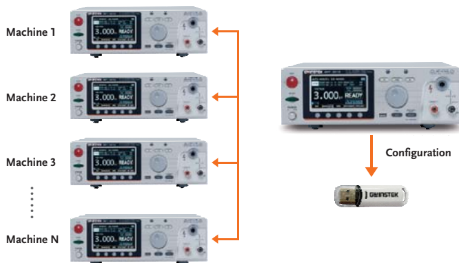
Export/Import of Setting Parameters

The GPT-9500 series supports the export/import of setting parameters via a USB flash drive. Users only need to set one tester, and the settings can be quickly and massively copied to all testers on production lines that not only improves the efficiency of production testing, but also avoids errors caused by repeated inputs.