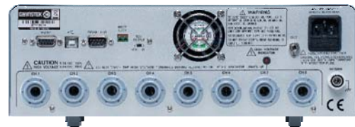
Channels Configured on the Rear Panel

The channel outputs of the GPT-9500 series are all configured on the rear panel. Other than the aesthetics of the system configuration, it is more important to effectively reduce the possibility of accidental contact by personnel. Each channel provides disconnection detection to avoid performing an invalid test.