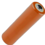
4 x LR6 1.5 V battery