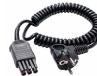
WS-04 adapter (UNI-SCHUKO angular plug)