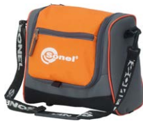
M6 carrying case