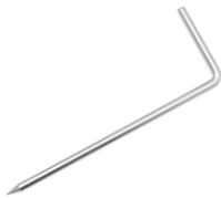
2 x earth con- tact test probe (rod), 25 cm only for MPI-507