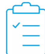
Calibration certificate with accreditation