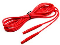
Test lead for fault loop measurement (banana plugs) 5 m / 10 m / 20 m