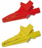
Crocodile clip 1 kV 20 A red / yellow