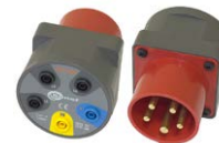
Three-phase socket adapter 16 A / 32 A