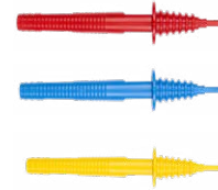
Pin probe 1 kV (banana socket) red / blue / yellow