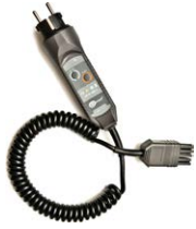
WS-03 adapter with START button (UNI-Schuko plug)