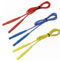
Test lead 1.2 m (banana plugs) red / blue / yellow