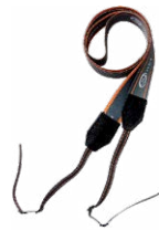
M1 hanging straps