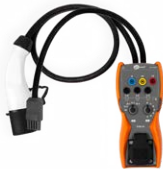
EVSE-01 adapter for testing vehicle charging stations