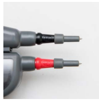
Push-on probe tips (limiters) 4 mm