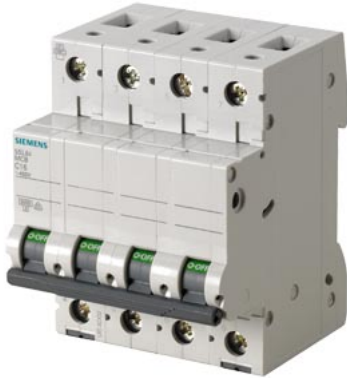
Miniature circuit breaker 400 V 6kA, 4-pole, C, 40 A