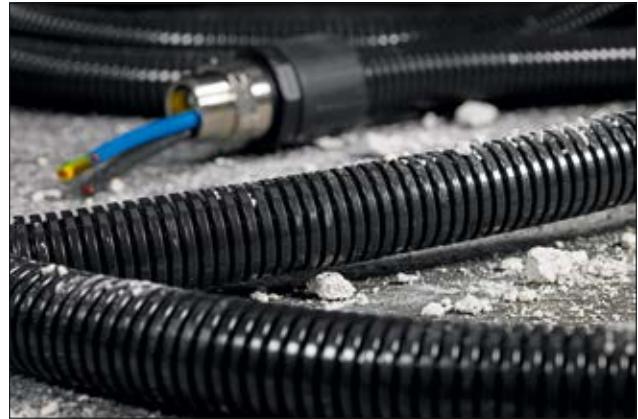
HelaGuard PA6 Standard for industrial applications.