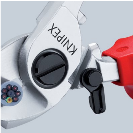
95 26 165: Catch locks shears to the opening spring inside