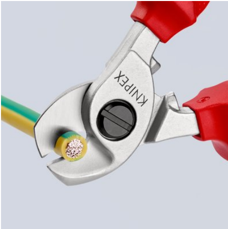
Cut performed with a Cable Shear: easy, clean cut without any deformation of the cable