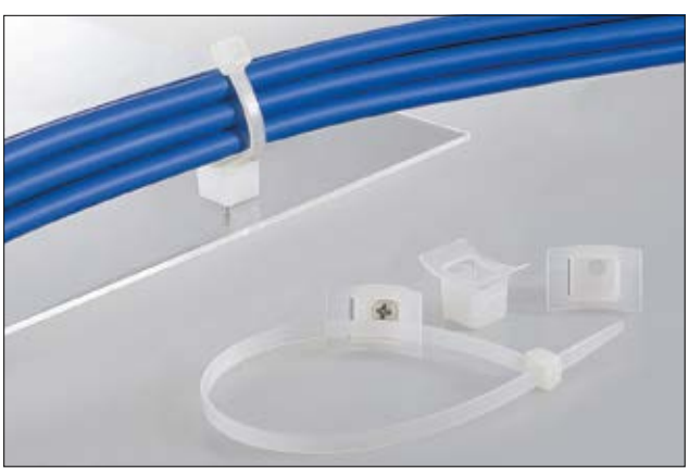
Cable Tie Mounts LKC Series.