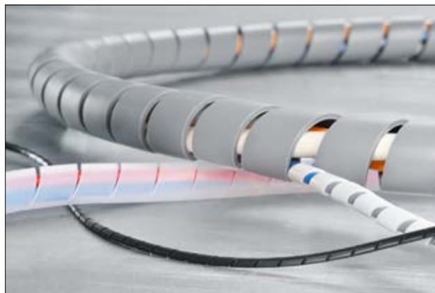
Spiral binding SBPE.