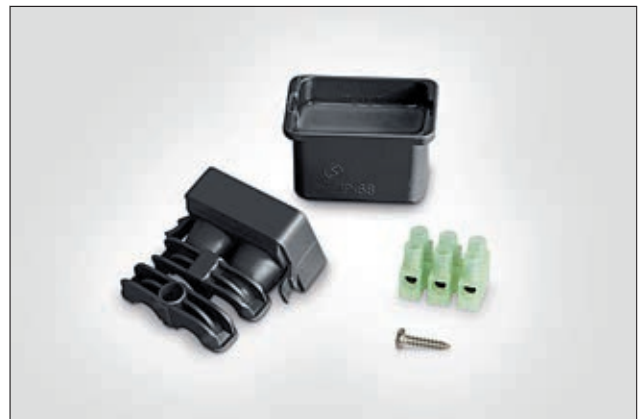
Gel cable joint Relilight V 31.5 U1.