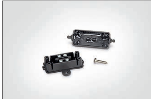
Gel cable joint Relilight V 2.75 I1.