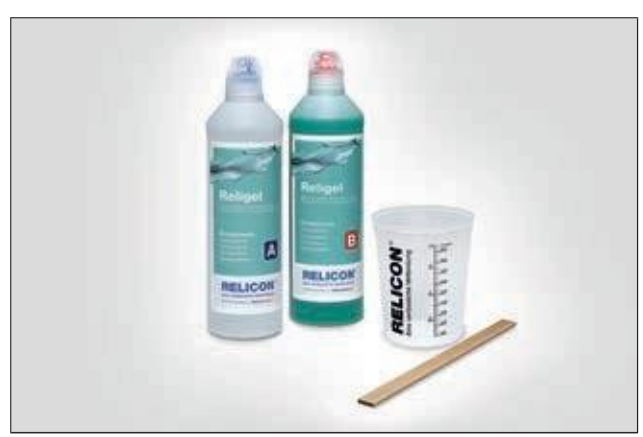
Two-component silicone gel Religel.