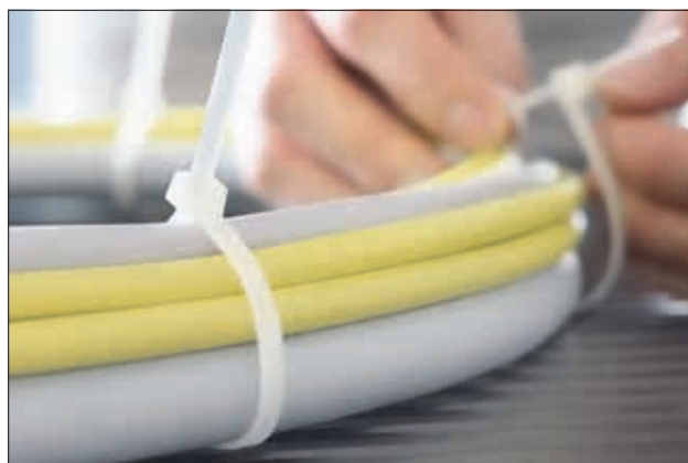
RELK releasable cable ties for temporary bundling.