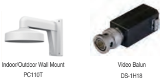
Indoor/Outdoor Wall Mount PC110T